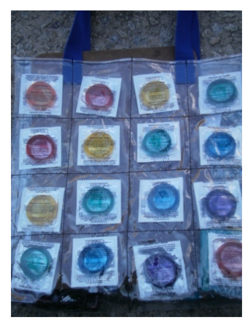
Free, Take One...

It's always better to be safe than sorry. Protect yourself and your community. Lower the statistics for teen pregnancy, HIV, and other STD's in South Carolina.